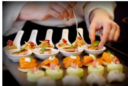
Culinary Skills (Catering)